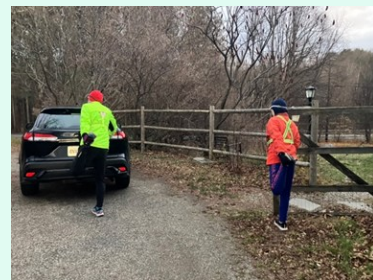
Race done, stretch time